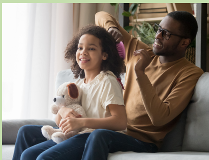
Daddy Hair Love