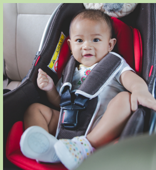
Baby Safety & Mini Baby Safety