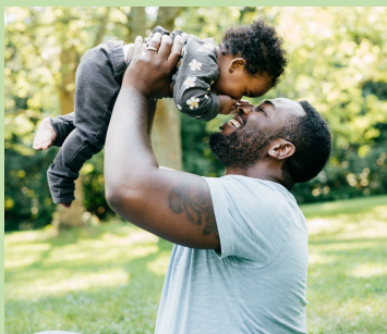
Father's Feelings Perinatal Safety Kit ($400 worth of baby safety items)